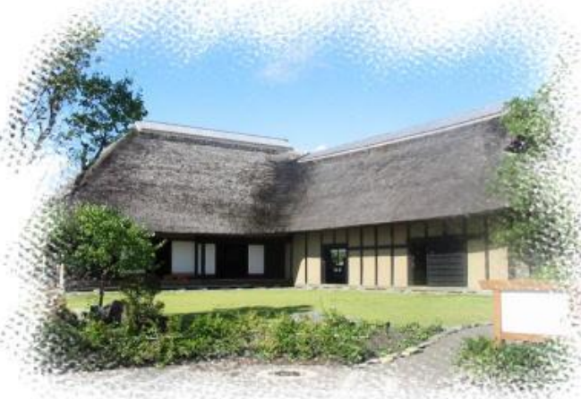
Nambu Magariya (Nambu Bent House): L Shaped farmhouse formed by integrating the main house and the horse barn.

Morioka Handi-Works Square, one of the leading industrial tourism facilities in Morioka, is located near Lake Gosho where you can enjoy the beauty of all four seasons. It takes about 30 minutes to reach the Square from the city center, heading west on Route 46. At the workshop area, which has 15 studios of 11 business categories, you can see traditional skills of craftsmen up close. In addition to this, you can enjoy hands-on workshops of more than 10 different kinds of unique crafts and local dishes. In the Nambu Magariya, a kind of L-shaped farmhouse where people used to live in one wing with their horse(s) in the other, you will be able to experience history and understand how people in our region used to live in the Edo period. Now, we would like to introduce the hands-on experience of Iwate's unique crafts held in the various workshops in the facility.